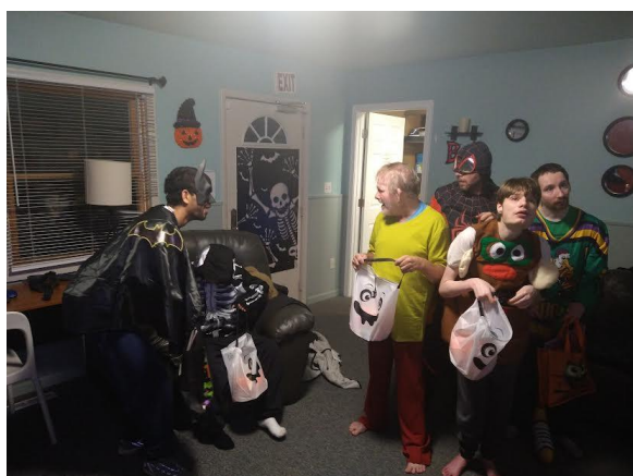
Michael's Home participants celebrating Halloween in style!

As we look forward to the additional upcoming holidays, we are excited to continue celebrating with our ALS-LM team and participants.